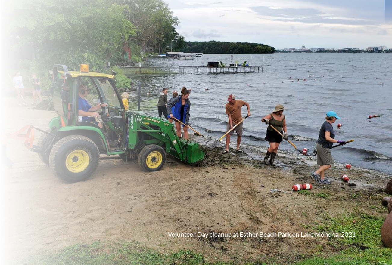
Volunteer Day cleanup at Esther Beach Park on Lake Monona, 2021